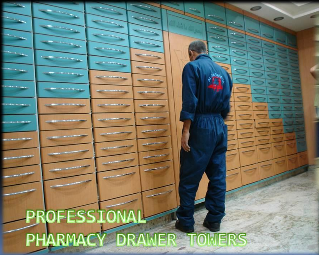
PROFESSIONAL PHARMACY DRAWER TOWERS